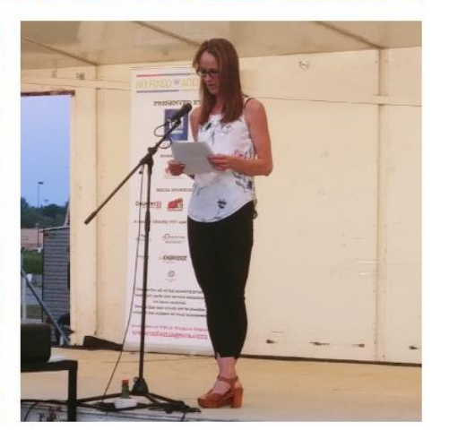
No Fixed Address 2018 is presented by: